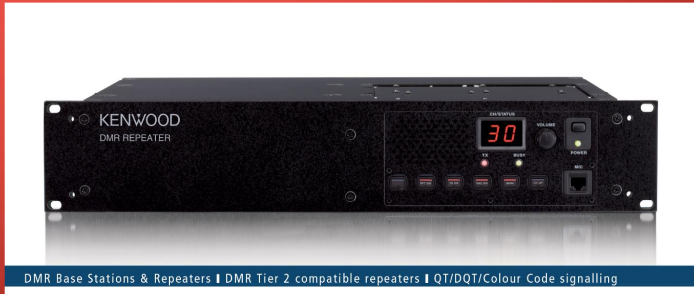
DMR Base Stations & Repeaters | DMR Tier 2 compatible repeaters | QT/DQT/Colour Code signalling